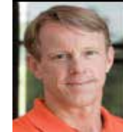
LAIN MEAR S Automotive Manufacturing Clemson