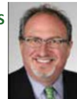
LES LENERT Healthcare Quality MUSC